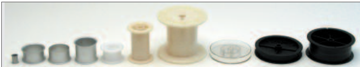
11AL 12AL 13AL 14AL 20PS 24PS 25PS FF 41B 41C